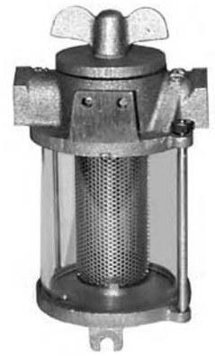
SA Series has a Lucite Sight Glass