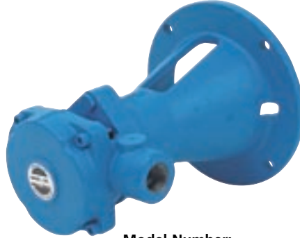
Model Number: 0505C-DE