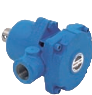
Model Number: 0505C-DH