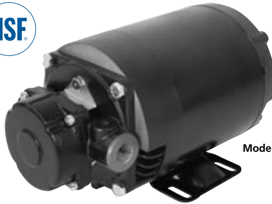
Model Number: NR5