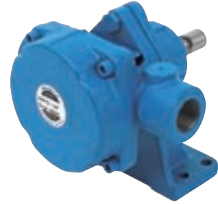
Model Number: 0507C-DP