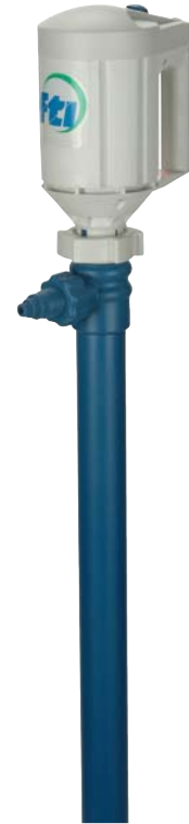
PFP with M3V motor