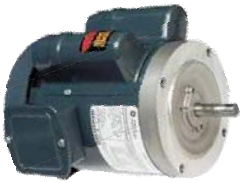
110/220 VAC Motor