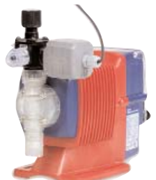
EW with Multifunction Valve & Posiflow

2-Year Warranty "Bumper-to-Bumper" On All E-Class Pumps - Including Wetted Parts