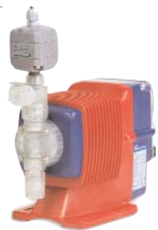
EW with Posiflow

Easy Draw-Down Calibration - In the calibration mode the user only needs to start and stop the pump, enter the draw-down volume and the pump calibrates volume-per-stroke.